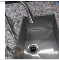
Brushed Nickel Fixtures