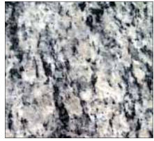
Granite Counters in Kitchen