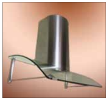
Stainless Steel and Glass Range Hood