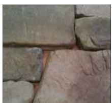
Cottage-style Exterior With Brick or Stone