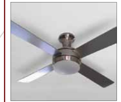
Great Room Ceiling Fan and Pre-wired Rooms