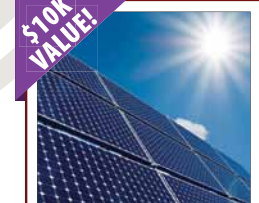
$10K VALUE! 2.8 kW Solar System w/20 Year Prepaid Lease