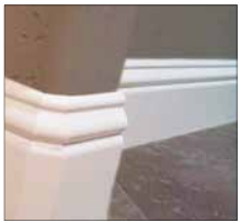
Oversized 5 1/4" Sculpted Baseboards