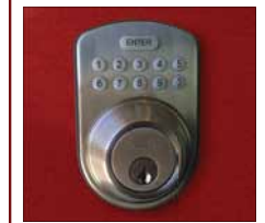
Keyless Lock at Entry and Garage

See your sales agent to find out about all of the other included features!