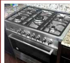
Commercial-Grade Gourmet Range