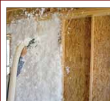
2 x 6 Exterior Walls = 60% More Insulation