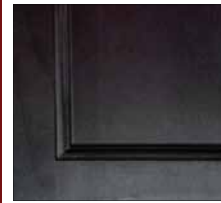
Built-in Cabinets in Laundry & Master Bath