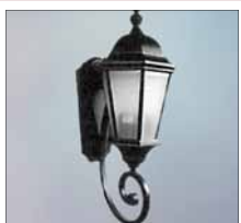
Exterior Carriage Lights