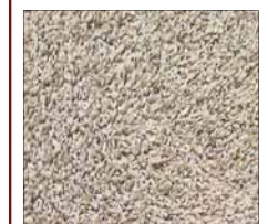
Premium Level 3 Carpet