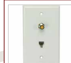
All Bedrooms Phone, Cable & Internet Ready